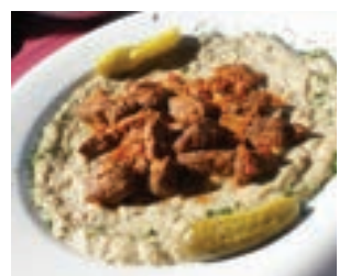
SULTANS DELIGHT LAMB