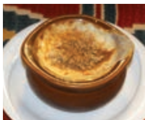
BAKED RICE PUDDING