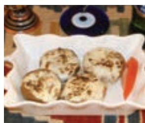
MUSHROOM IN THE OVEN